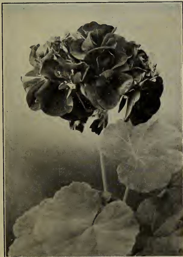
Abbie Schaffer—See page 14